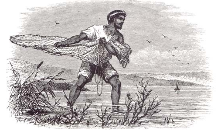
A cast-net fisherman working from shore

The fisherman's work was also difficult physically, entailing rowing to and from the fishing sites, hauling in heavy nets and